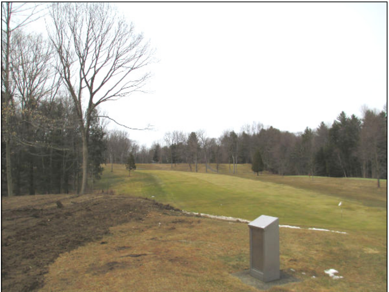
Clearing the right side of #16 should help a green that's been a maintenance challenge over the years