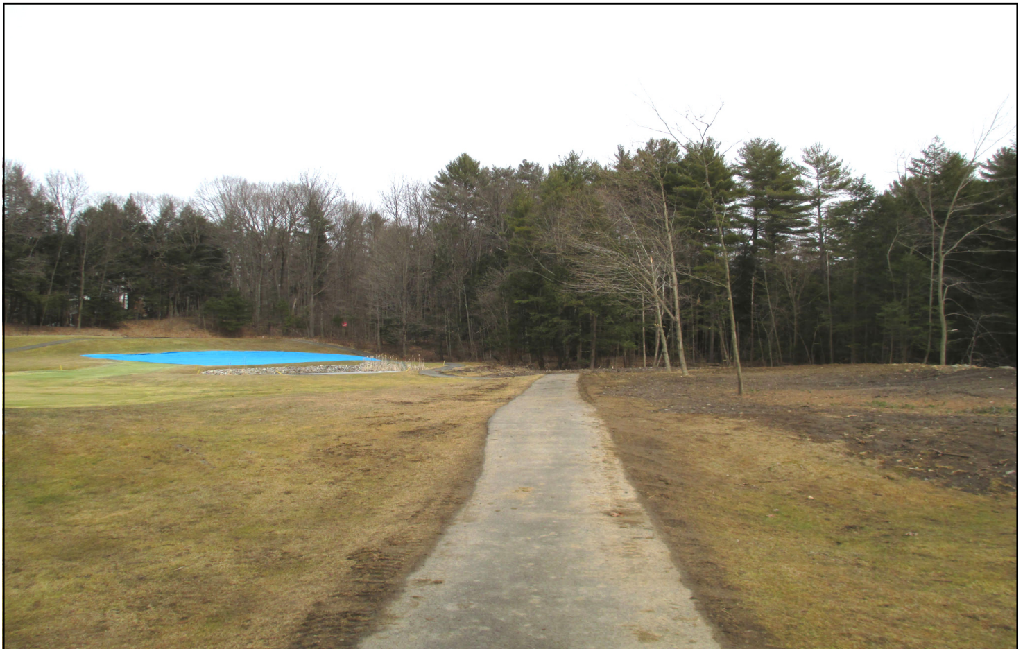
Right side clearance of # 11 will provide much more sun and air to the usually wet hole and green.