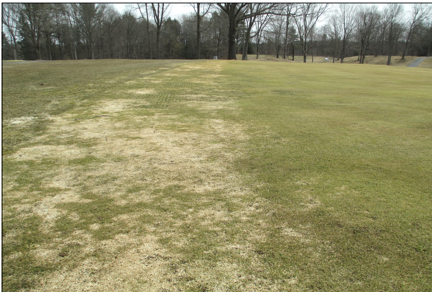
The result of not spraying snow mold inhibitor can be seen in this missed patch on #14