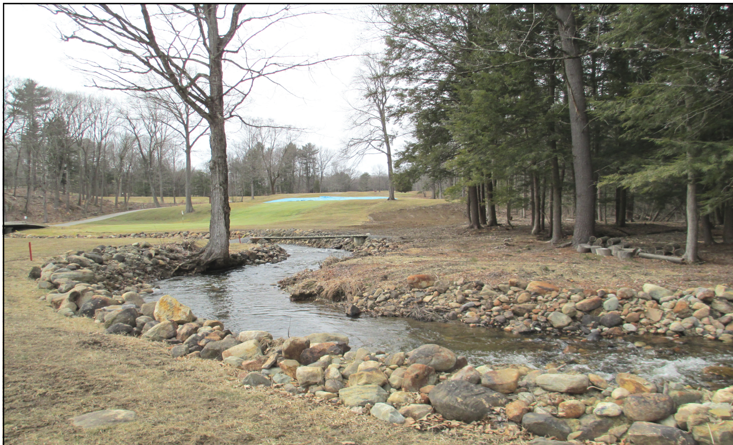
Work on # 12 implementing the USGA's recommendations.