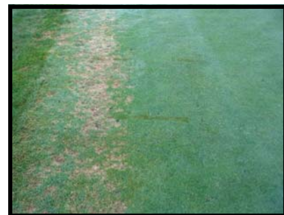
There's a fungus among us