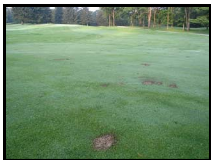
Please replace your divots