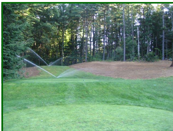
Above: The area around the extreme back tee on #7 has been cleared, raked and seeded. For those of you who have never played from this tee, you have a real thrill (or not) ahead of you should you try the hole from this tee once it is ready for play. The view is wonderful, the scores - maybe not so wonderful