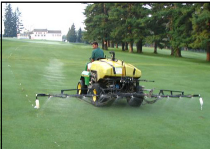
Applying the appropriate anti-fungus chemicals

As always, please see me or any Green Committee member if you have special concerns or questions as they relate to the course. Thank you