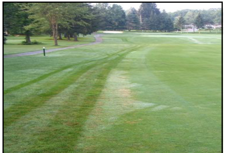
The areas not reached by the irrigation system turned brown