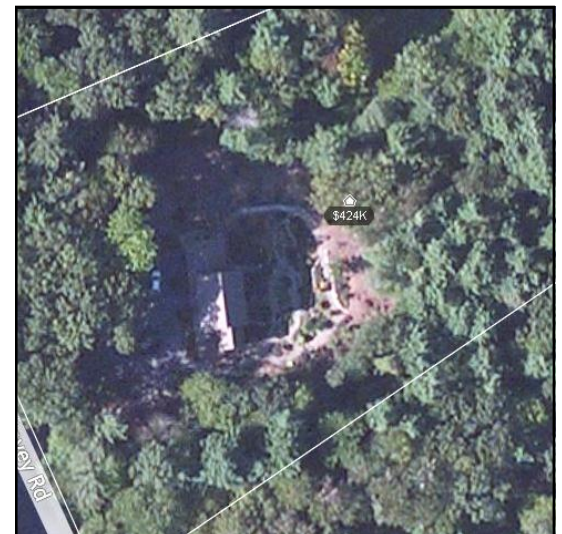
My current solitude

So I've come full circle. Golf is a big part of my life, but it's not my entire life. I realize that for me, rationing out my time on the course and my exposure to the game makes it more special, ensuring a lasting love of The Game. If I ever lose that, I'm in big trouble.