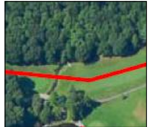
The Tee Shot on 12 Right is Wrong Left is Right

All reciprocal tee times must be made through the Golf Shop