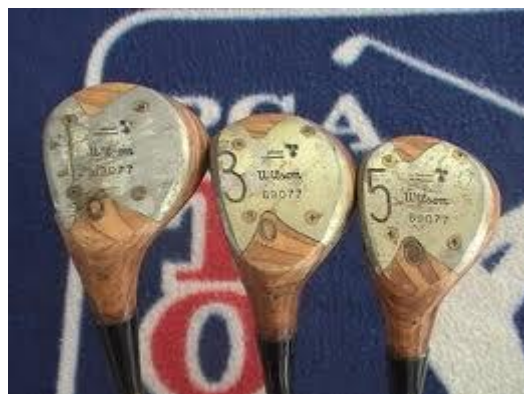
Wilson Cup Defender Woods

Bring an armful home. Scour them clean. Rub lemon oil into the wood, and mink oil onto the leather grips. Tomorrow, take them out on the course. Send the ball flying with a satisfying crack of wood, the club in your hand ecstatic as a blind man with restored sight.