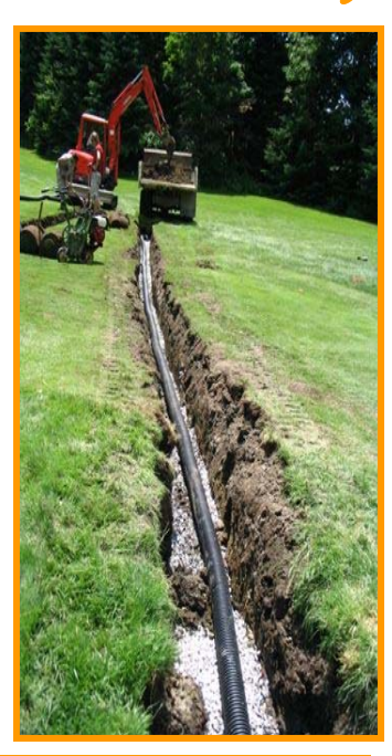
The #7 drainage project was completed in just two days.